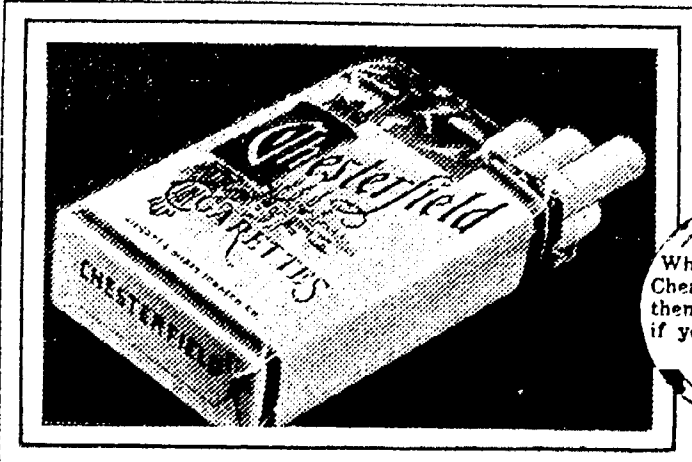
Wherever you buy Chesterfields, you get them just as fresh as if you came by our factory door